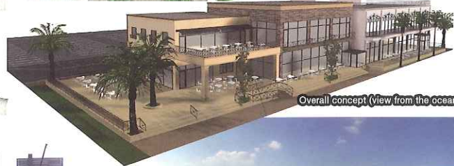
Overall concept (view from the ocean)