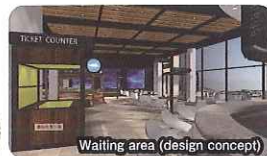
Waiting area (design concept)