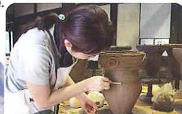
Pottery-making experience (example)