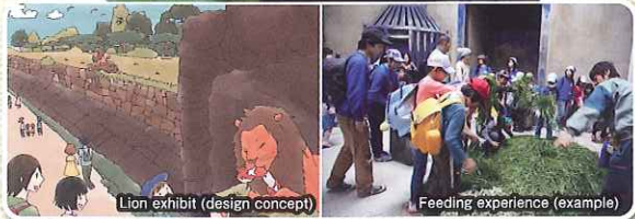
Lion exhibit (design concept)