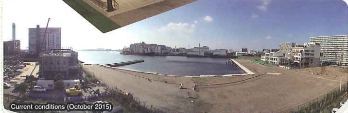
Current conditions (October 2015)