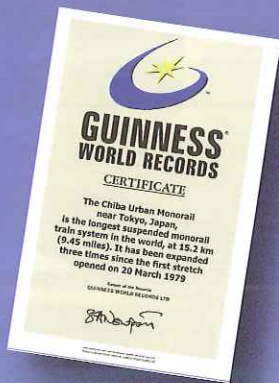
▲World record certificate

A suspended monorail is one where the cars run while hanging under the tracks!